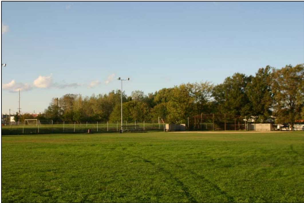
ConEd Ball Fields – Photo looking north from fields toward Project Site. The Project is expected to be screened by the trees beyond the field.