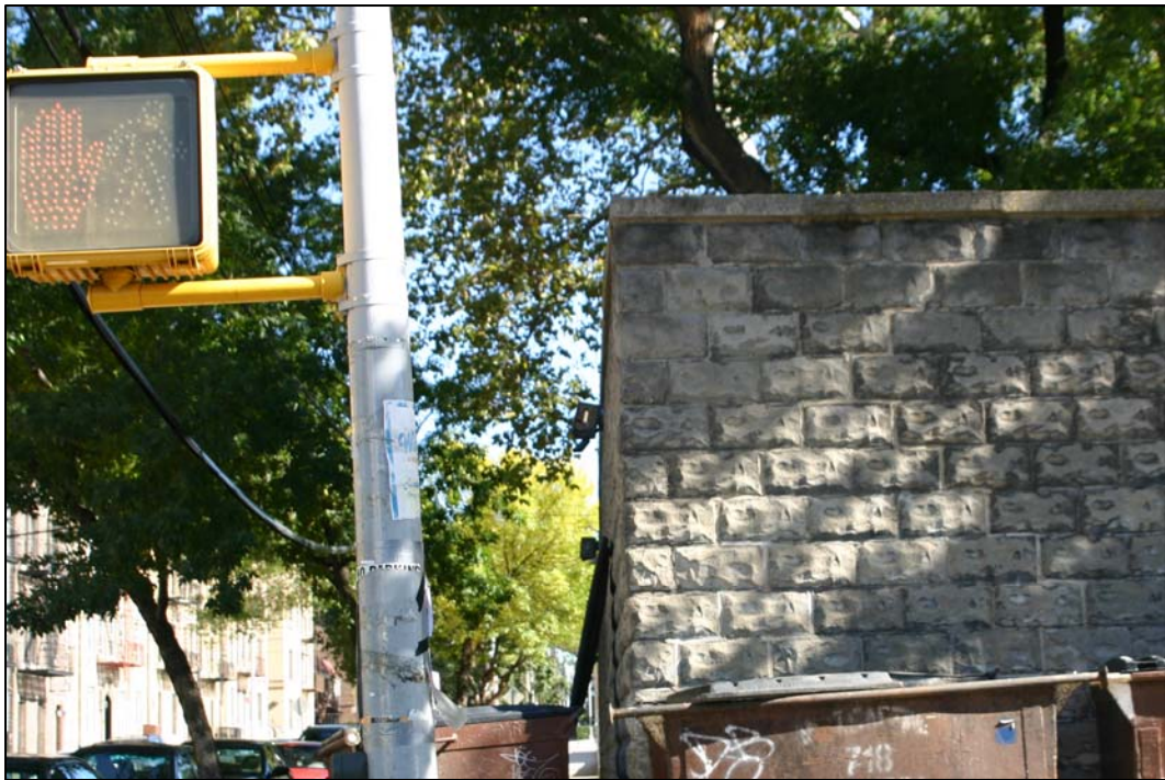
Bohemian Hall – Photo looking northeast from outside edge of resource (stone wall) toward Project Site.