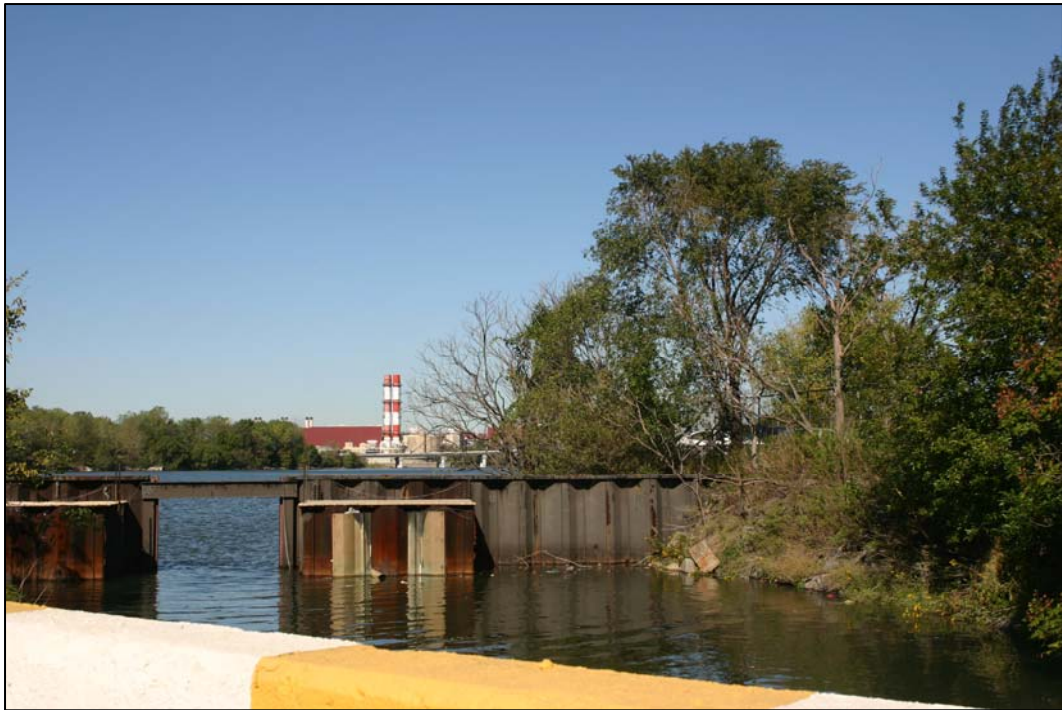
Marine Air Terminal at LaGuardia - Photo looking northwest from terminal access road toward Project Site, located behind large trees on the right.