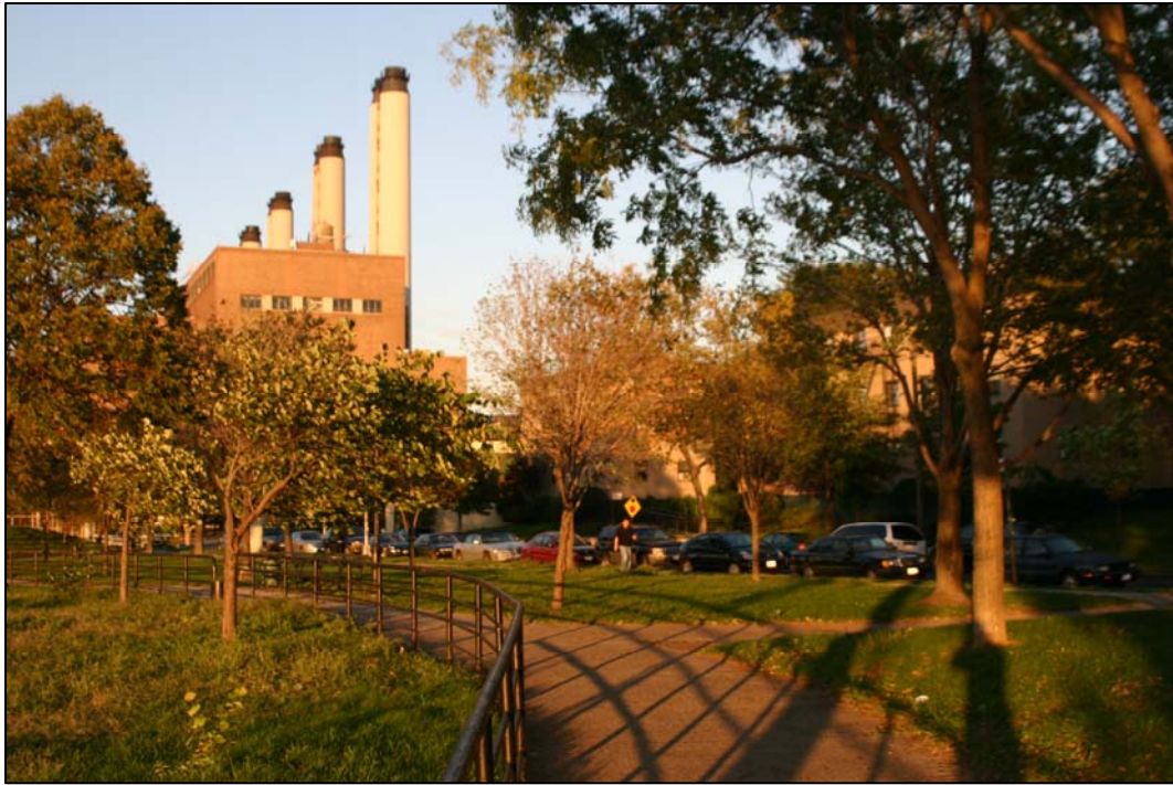
Ralph DeMarco Park – Photo looking northeast from park toward Project Site (behind vegetation to right). AGS facility is visible on left.