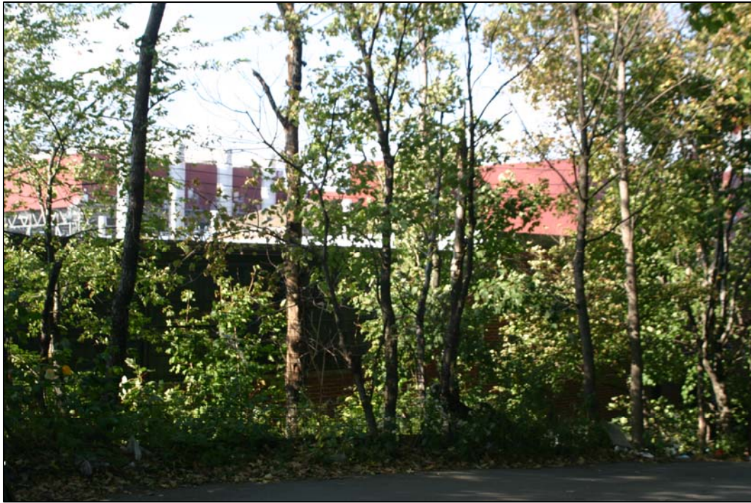
Steinway House – Photo looking northwest from resource toward Project Site.